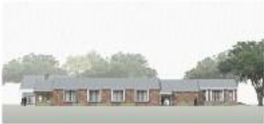
VIEW FROM EAST PROSPECT STREET