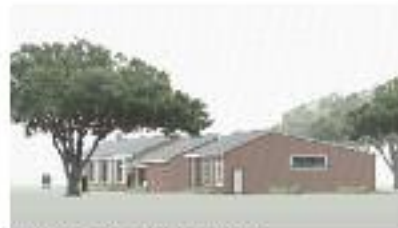
PERSPECTIVE VIEW OF THE SIDE FACE