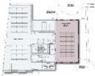
PARTIAL PLAN DIAGRAM