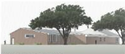
PERSPECTIVE VIEW OF THE REAR FACE